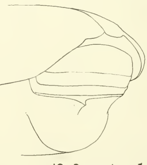
9. S. hermosus of